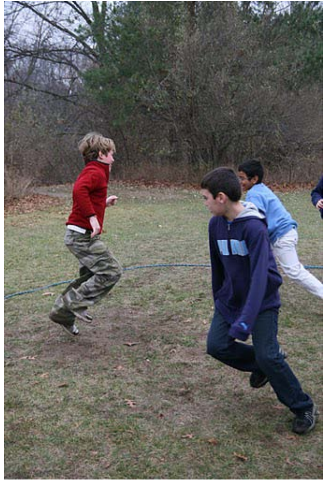
Beit Sefer students running at their visit to Global Villages.