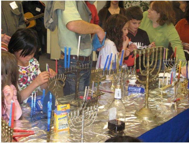
Our Menoroth at the annual Chanukah party