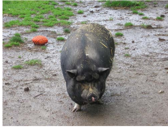
Another creature at the Rabbit Sanctuary