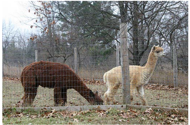
Animals at Global Villages