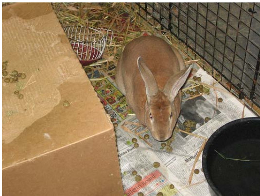
A bunny at the Rabbit Sanctuary