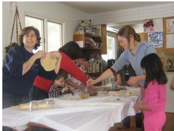
Several Beit Sefer families got together to make Hamantaschen last February