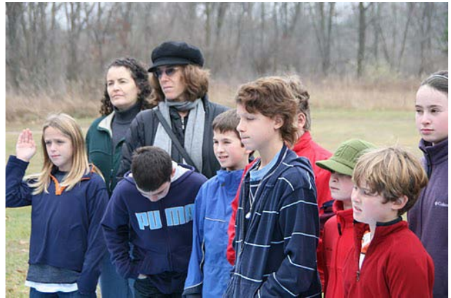
Beit Sefer parents and kids at Global Villages.