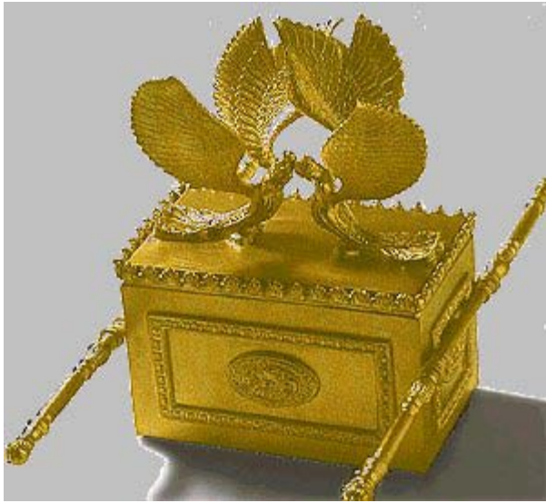
Twentieth Century Interpretation of the Mishkan