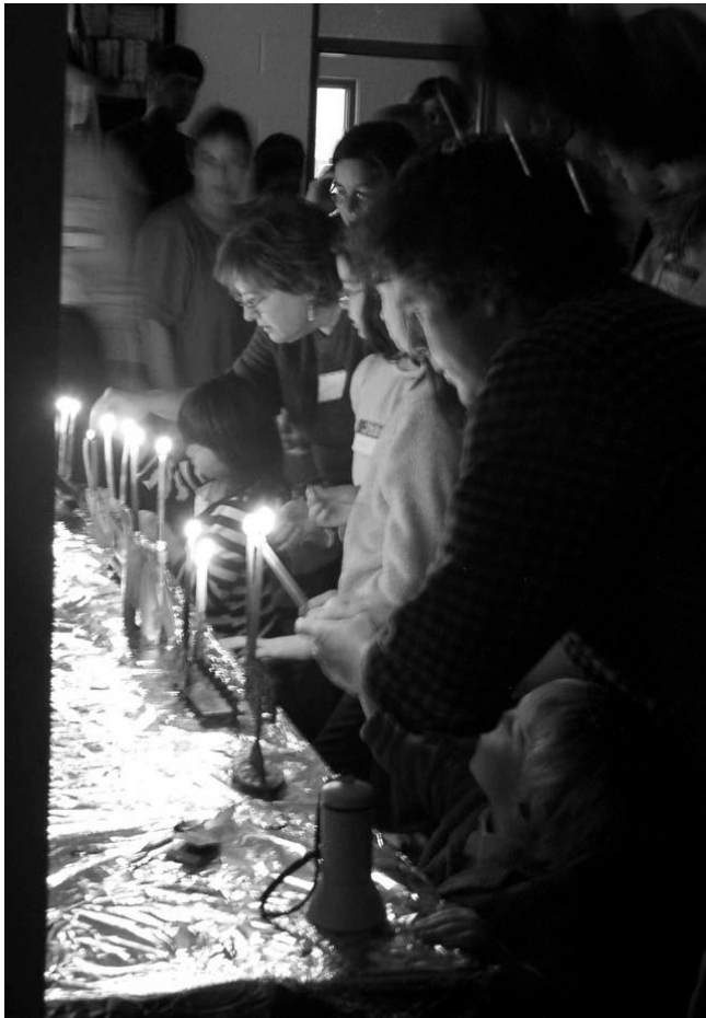
Group menorah lighting at a Channukah party of year's past