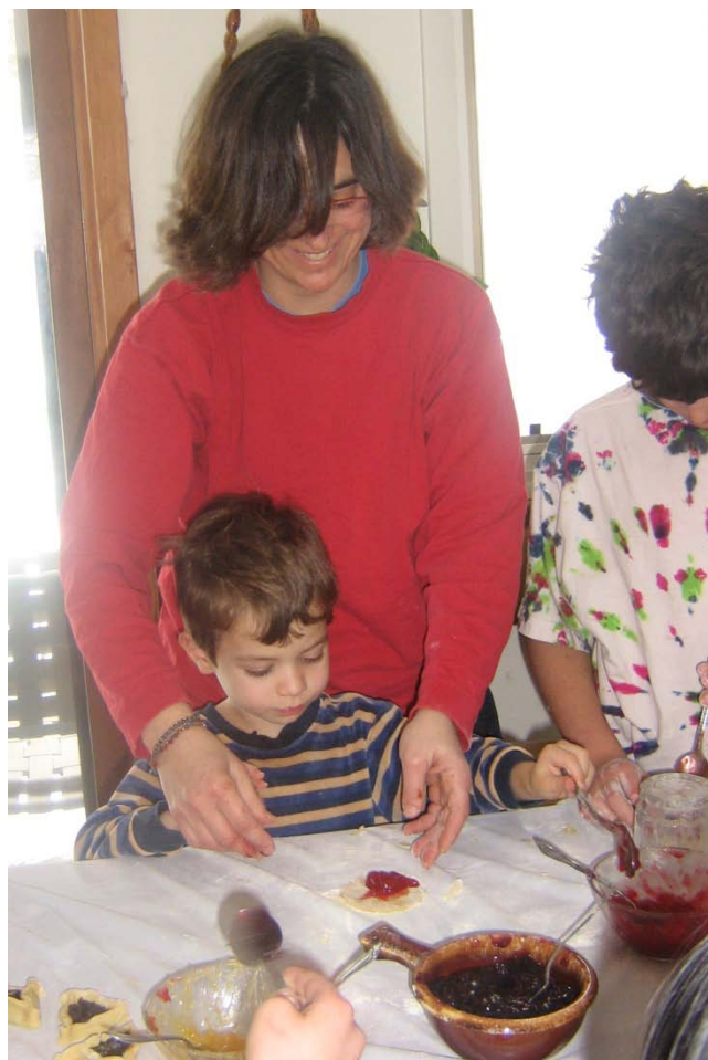
Hamantaschen making!