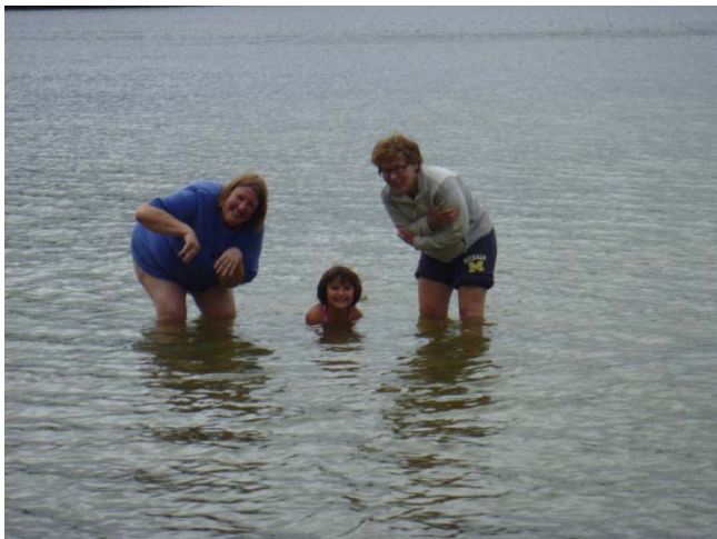
Mikvah of the brave at the annual retreat!

We extend a big formal welcome to them as new members!