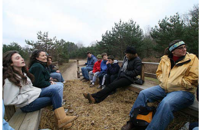
Hav folks at last month’s field trip to Global Villages in Howell