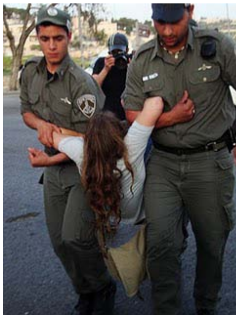
A protester at Shiekh Jarrah being carried away.

To read more of Elie's adventures see her blog at http://eliesgapyear.blogspot.com/