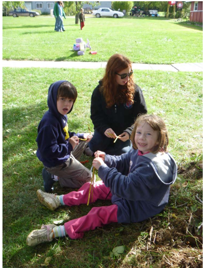
Members of the ketanim group in our Beit Sefer hold class at our annual retreat.