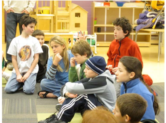
Beit Sefer kids listen intently.