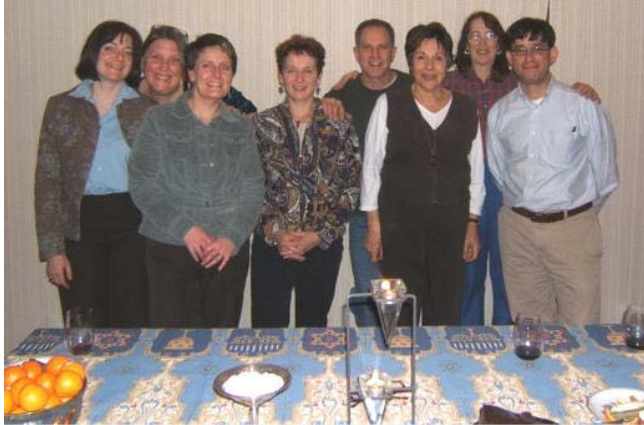
Havurah Board 2009