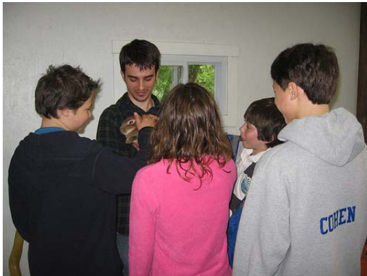
Beit Sefer teens visit a Rabbit Sanctuary!