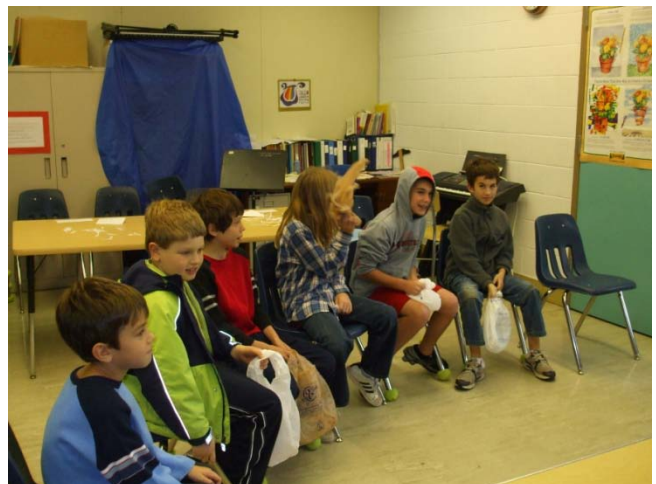
Beit Sefer kids in action!